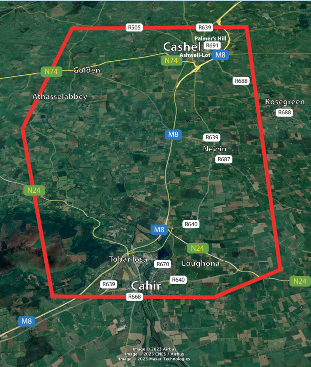
Proposed Study Area

The Project Team would like to hear your views in relation to the study area that you want the project team to be aware of i.e. constraints, opportunities, concerns, key features, attractors, etc. This information will inform the development of route options.